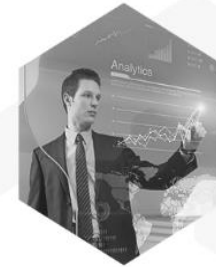
Digital Business Solutions & Technology