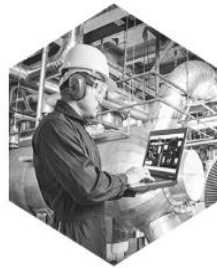
Manufacturing Machinery & Engineering