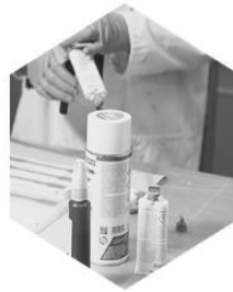
Specialty Chemicals & Coating Products