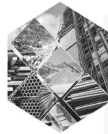
Infrastructure & Building Materials