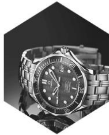
Specialty Consumer Goods & Services

Present with local offices, staff and expert networks, GTI Partner offers full coverage of the following industry segments to support your project: